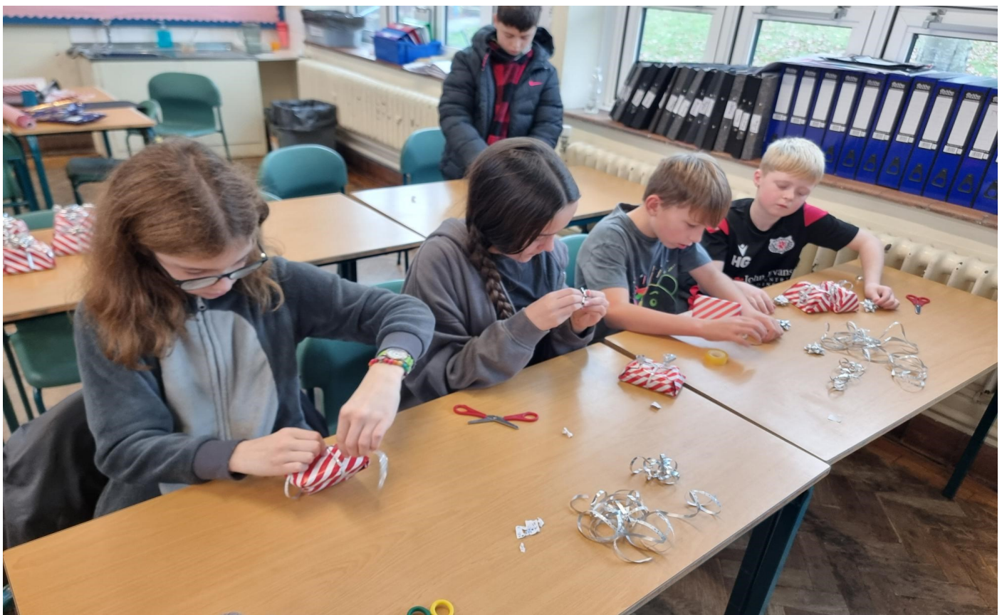
Dosbarth Y Fan Fach have been busy elves this morning, making a start on the Sweet Treat Santa Sleighs!