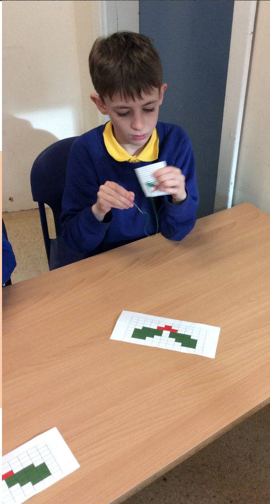
The children from Llyn Elsi have been practising the cross-stitch for the Glorious Christmas Tags!