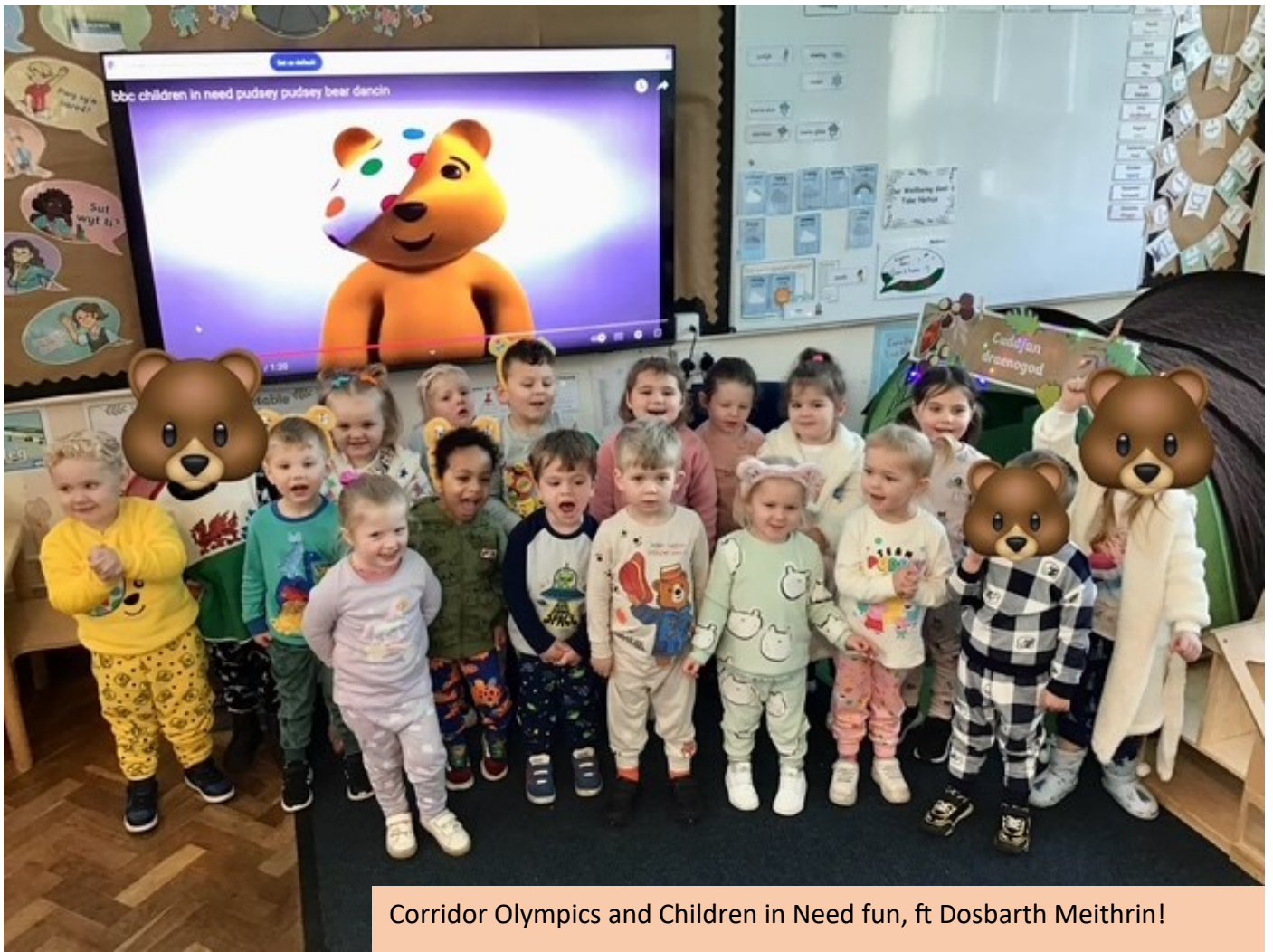
Corridor Olympics and Children in Need fun, ft Dosbarth Meithrin!