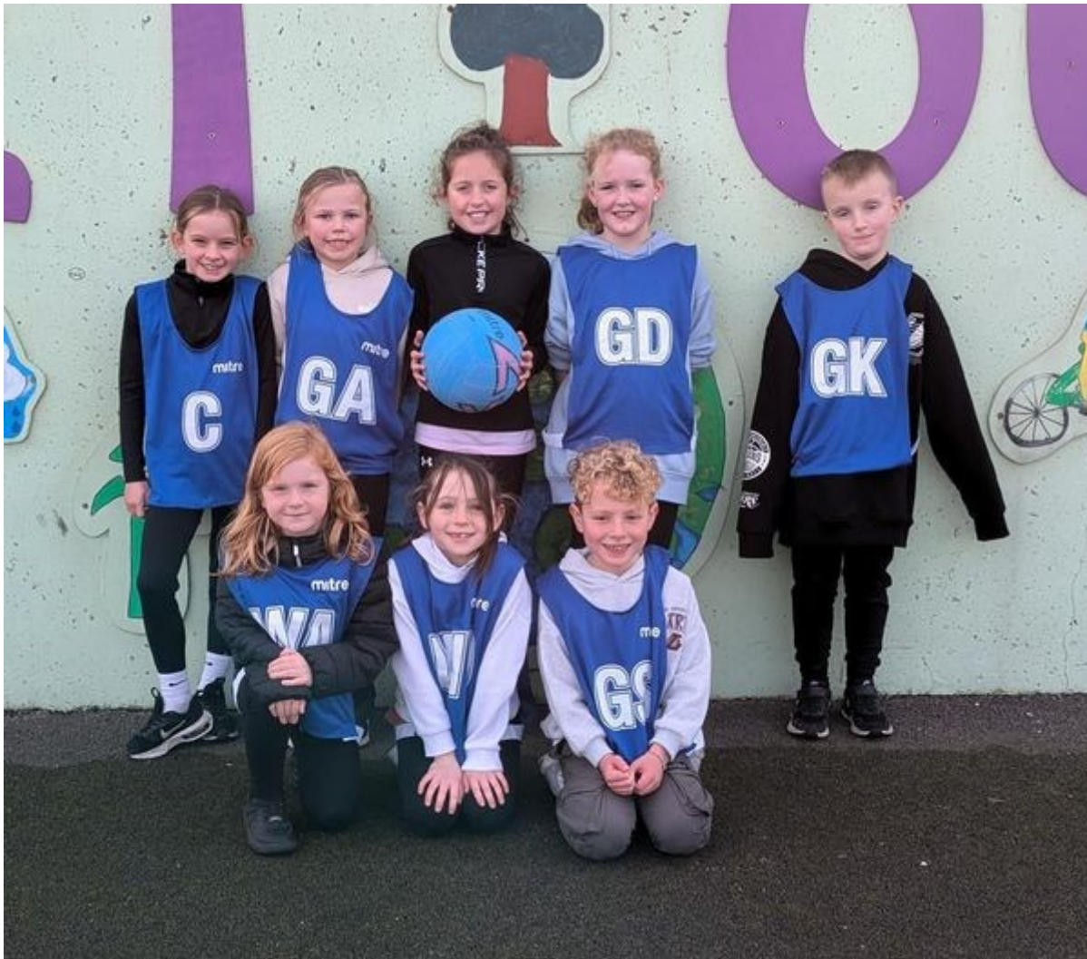
Team Carmel had a great time at a netball festival this morning.