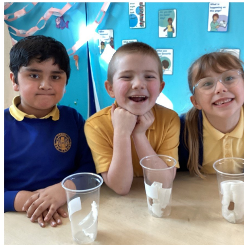
Dosbarth Brenig have been preparing their beans and are now looking forward to watching them grow!