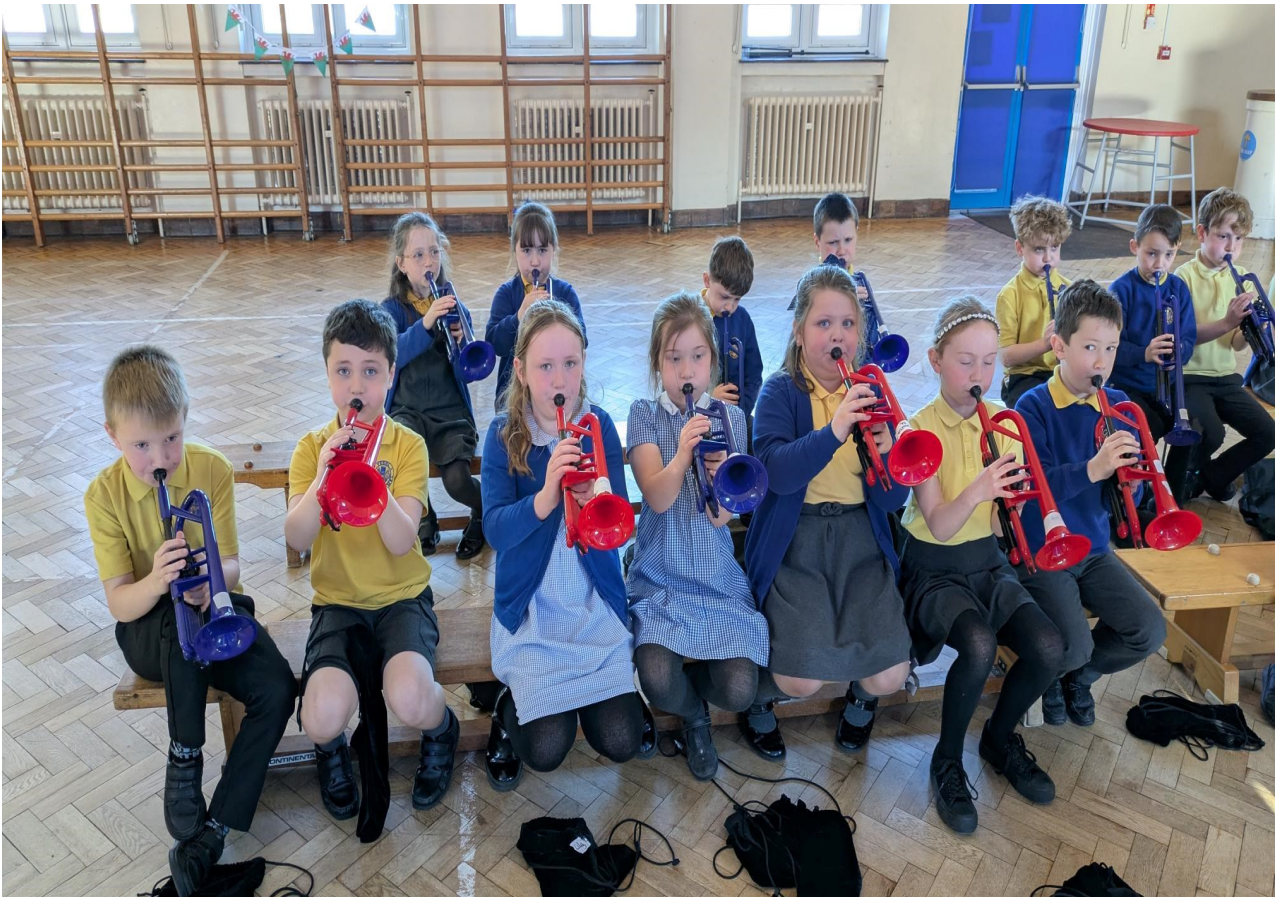
Dosbarth Llyn Celyn have been having lots of fun in their p-cornet and p-bone lessons.