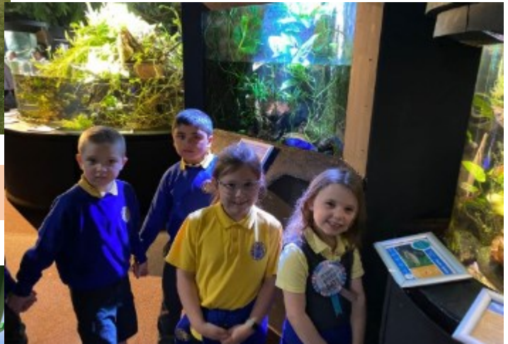
Been to the aquarium....