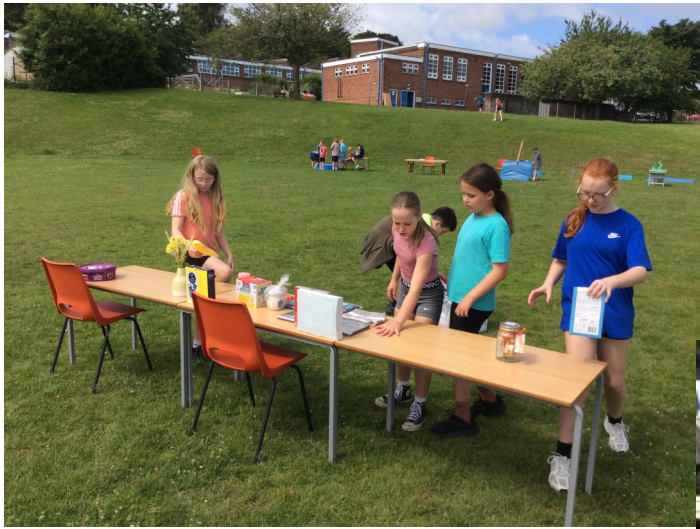
We've raised money for school....