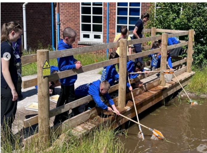
Pond dipping and sign language