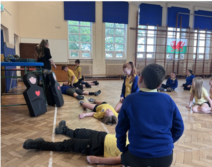
Learned about lifesaving, animating, stop-motion...