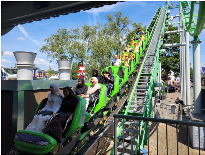
To the Theme Park....