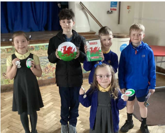
Spoken LOTS of Welsh.....