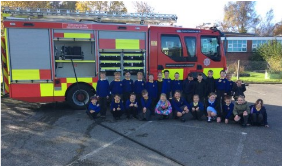
We've learned all about the World of Work....