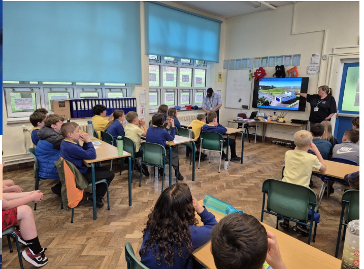
And learning visits from RNLI and the police...