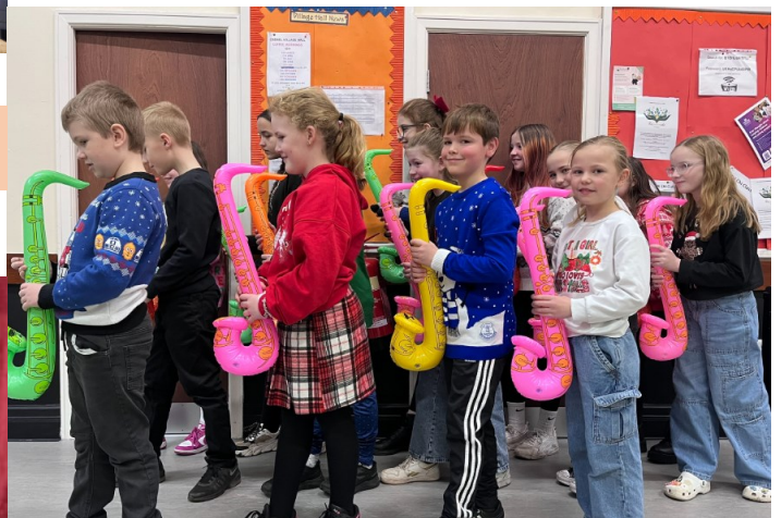
We've been out singing in the community....