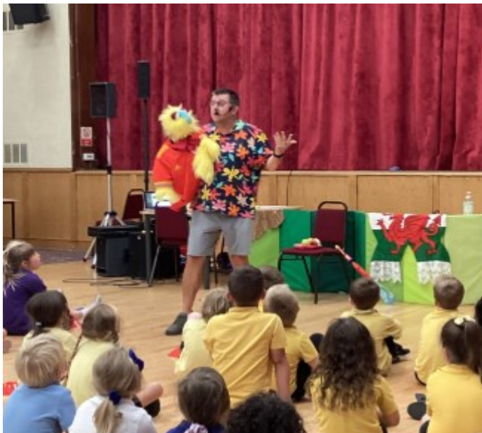
And of course, out singing in Welsh!