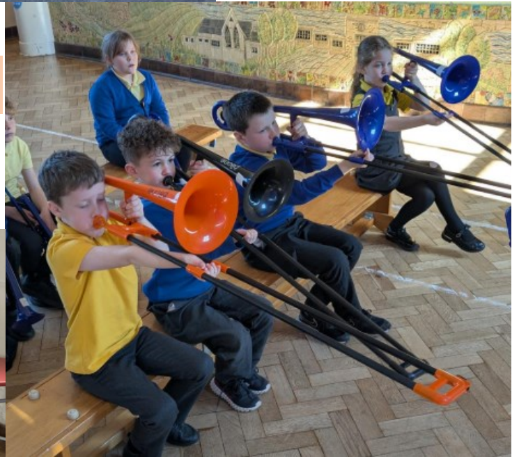
Learned musical instruments....