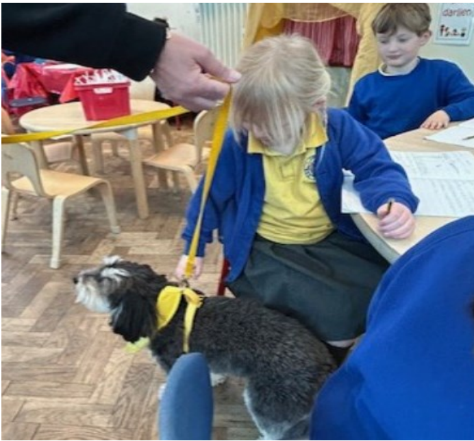
We've had visits from therapy dogs...