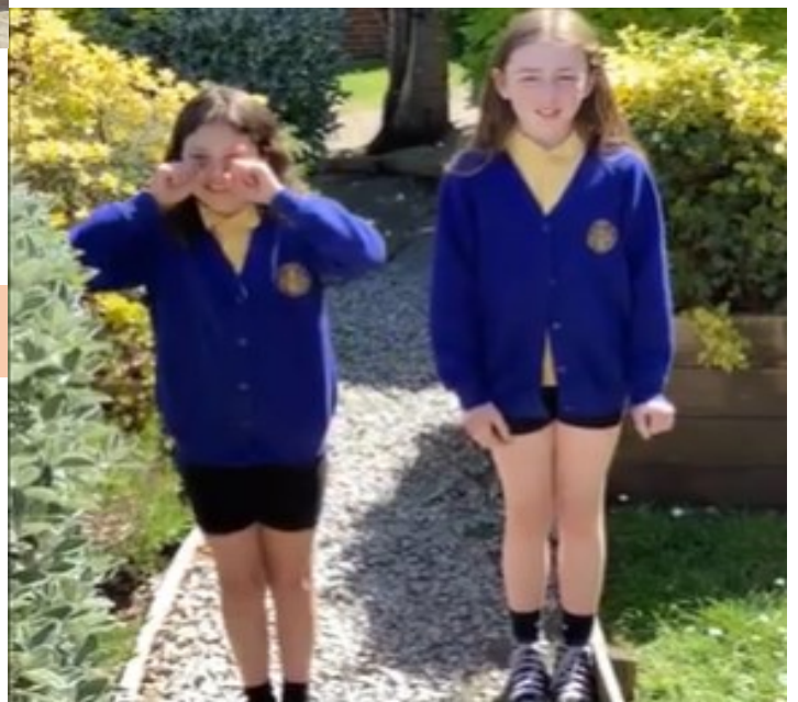
And even taught you Welsh too!